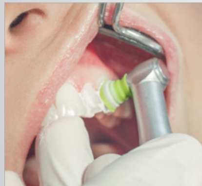
Smooth surface at the edge for gentle cleaning into the sulcus.

W&H offers the appropriate LatchShort prophy brushes and cups in various hardness with a shortened shaft for Proxeo Twist Cordless Polishing. They were designed in consultation with Prophy users. Great emphasis was placed on properties such as optimal adaptation, simple paste pickup and distribution, as well as gentle cleaning into the sulcus.