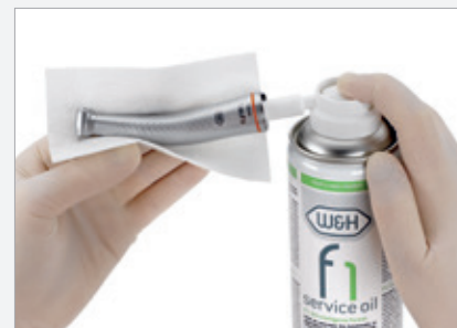
Perfect for manual maintenance W&H Service Oil F1 in the MD-400 spray can.

W&H dental drives achieve top speeds of up to 390,000 r.p.m. F1 provides excellent lubrication and internal cleaning thereby ensuring fault-free operation of the instruments.